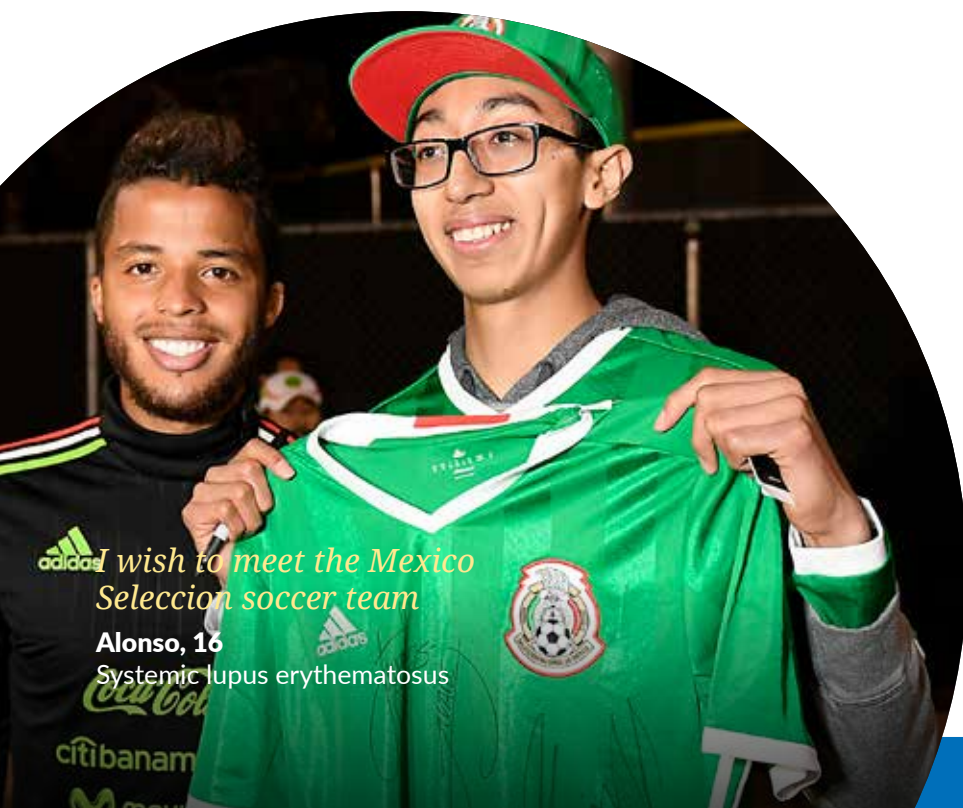
wish to meet the Mexico Seleccion soccer team